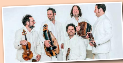
Le Vent Du Nord