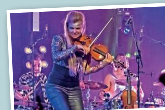
Blackbeard's Tea Party

A £26 (£21) Limited £10 tickets for 25yrs and Under