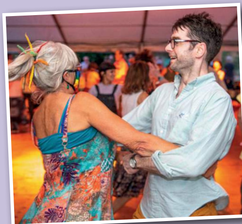
See www.sidmouthfolkfestival.co.uk for more details.

The 'divas of the dance world', this all-female line up play an unusual and inspiring smorgasbord of tunes from around Europe. £16