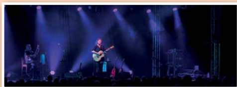
Show of Hands

£37 (£32) Limited £10 tickets for 25yrs and Under