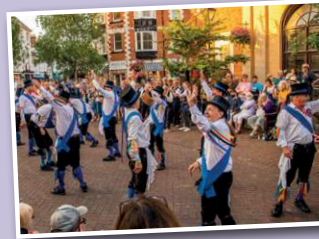
Great Western Morris

Thursday 3rd August 7.30-9.30pm Market Square