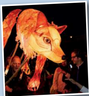
Torch Light Parade