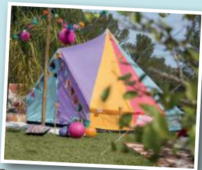
The Rainbow Tent