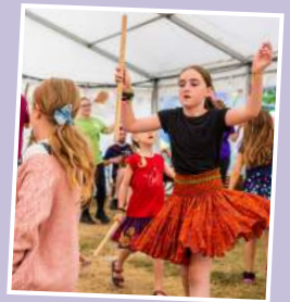
Morris Dance Workshop