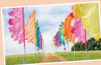
Route to Bulverton

Please give generously to the volunteer Festival collectors and help us keep events free for the future.