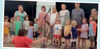
Sidmouth Mini Singers